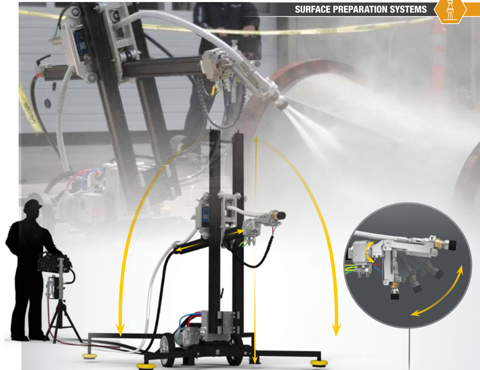
3-D CLEANING CAPABILITY 60 in. H x 84 in. W x 54 in. D (1525 mm x 2134 mm x 1372 mm)