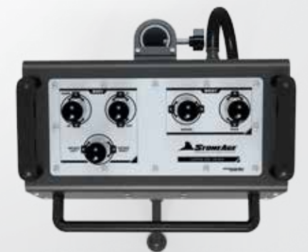
CONTROL BOX Allows safe, remote operation of high pressure waterblast equipment.