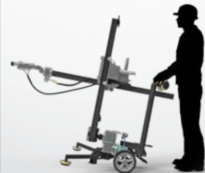
MODULAR SYSTEM Designed for portability and easy assembly.